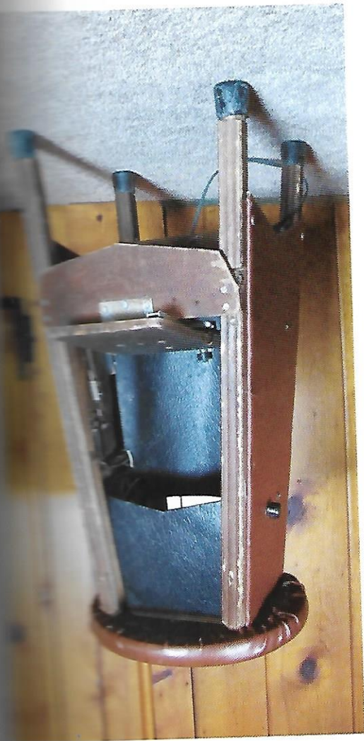
Brevet, dessins et photographie du tabouret utilisé par Tal dans les années 1960, incluant un amplificateur et une pédale de volume. al utilisait régulièrement ce tabouret dans la région de Sea Bright (New Jersey). Patent, drawings and photo of the stool he used in the sixties, including an amplifier and volume pedal. Tal used that stool when he was playing around the Sea Bright area.